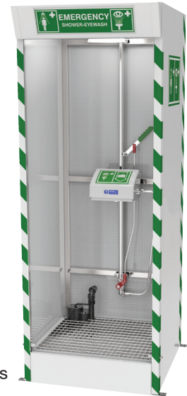
shown without strip screens

Designed for locations where space is at a premium or the shower needs to be enclosed, this emergency combination shower includes an integral drain sump and strip screens to reduce the risk of water outside the cubicle area. Includes interior mounted, ANSI compliant eye/face wash with cover. Shower and eyes/face wash are hand activated. Upgrade to add a 120V sump pump, suitable for non-hazardous locations.